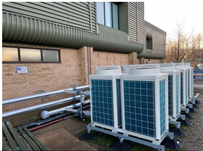
Heat Pumps at Abbey LC